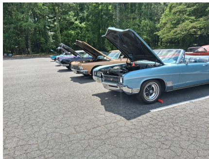
J.D Westfall’s 1967 Wildcat and 1971 Riviera